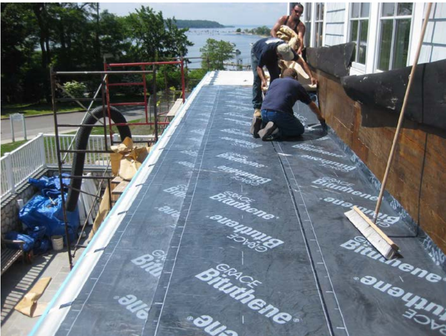
Forensic Engineering – Litigation Support - Restoration – Waterproofing at Cold Spring Harbor Library.