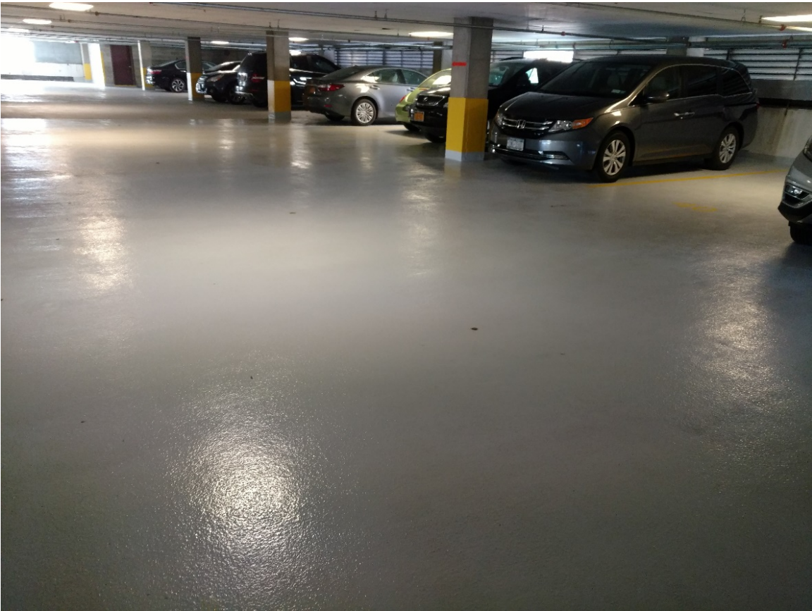
📍 Winthrop University Hospital in Mineola parking deck restoration design and repair