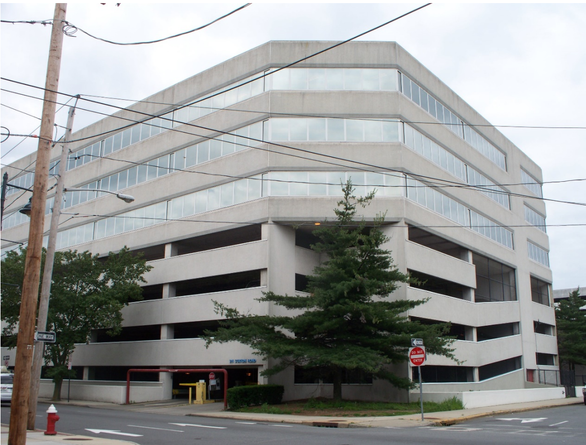
📍 Astoria Federal Saving Bank in Mineola parking garage structural restoration design