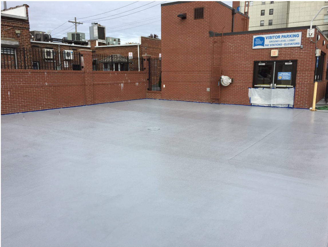
📍 Waterproofing overlay design at New York Presbyterian (Hospital) in Jamaica, New York