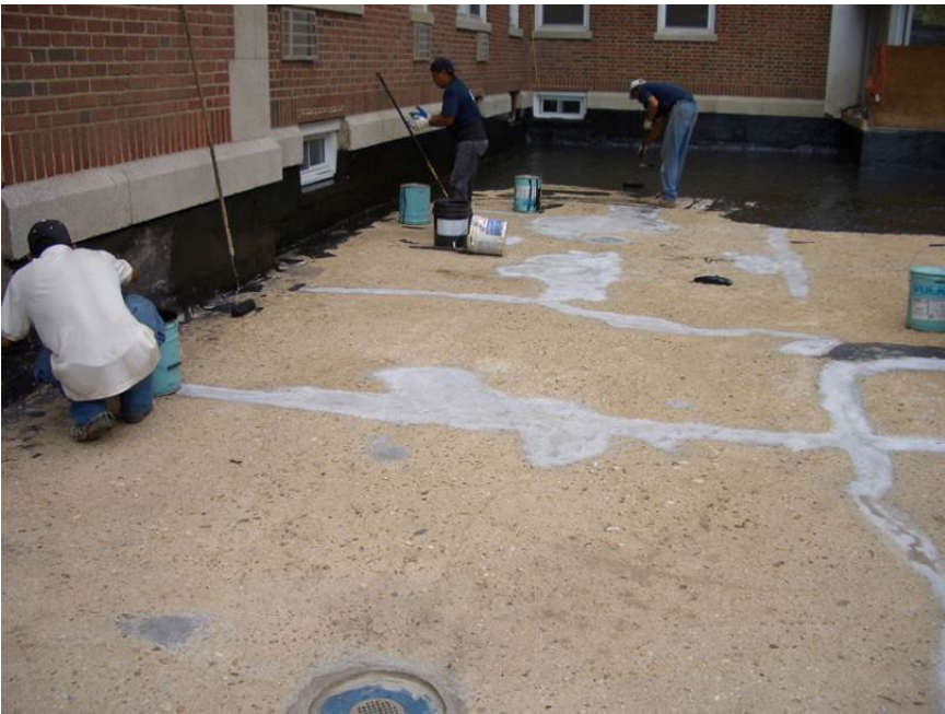
📍 Structural Engineering – Restoration – Waterproofing at 7th Avenue, Garden City